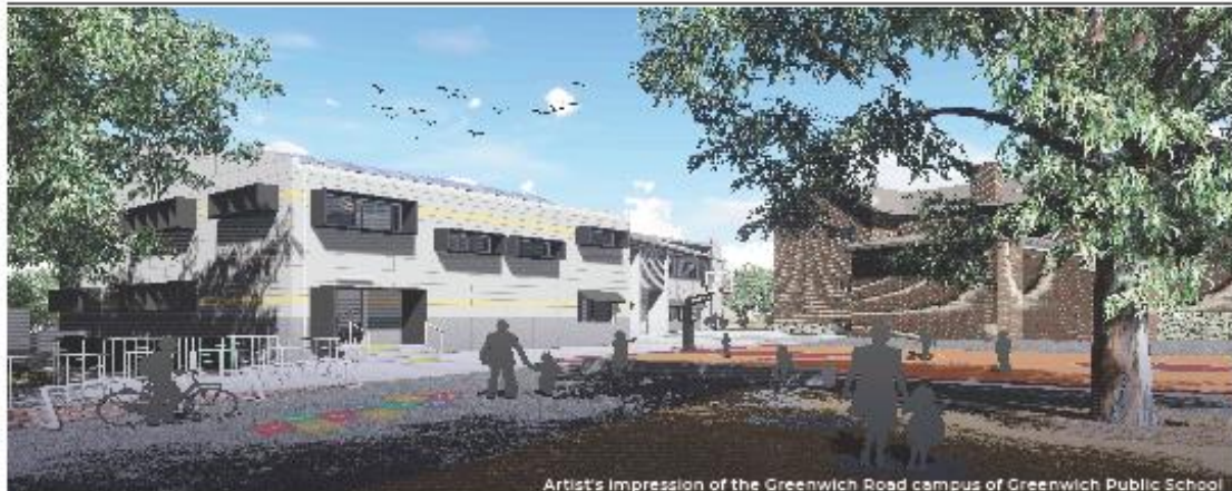
Artist's Impression of the Greenwich Road campus of Greenwich Public School